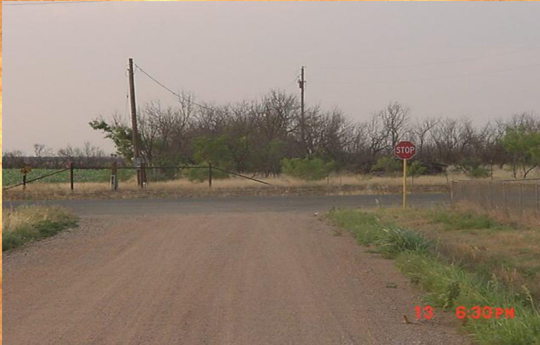
The junction of Co rd 387 and US 180. The cemetery is on the right. Notice the vegetation directly in the line of sight when on the road.