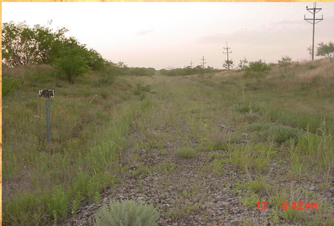
The deserted tracks, they follow a power line that parallels the road.