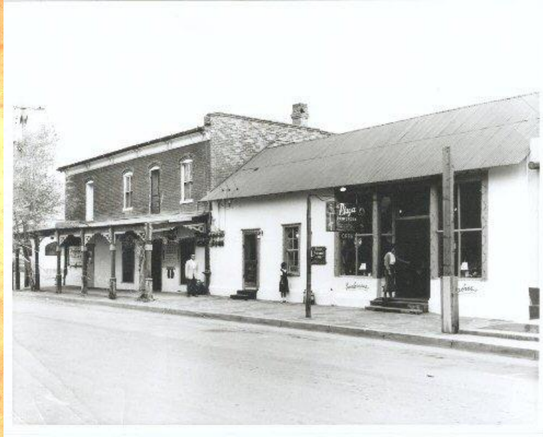
The building in 1940