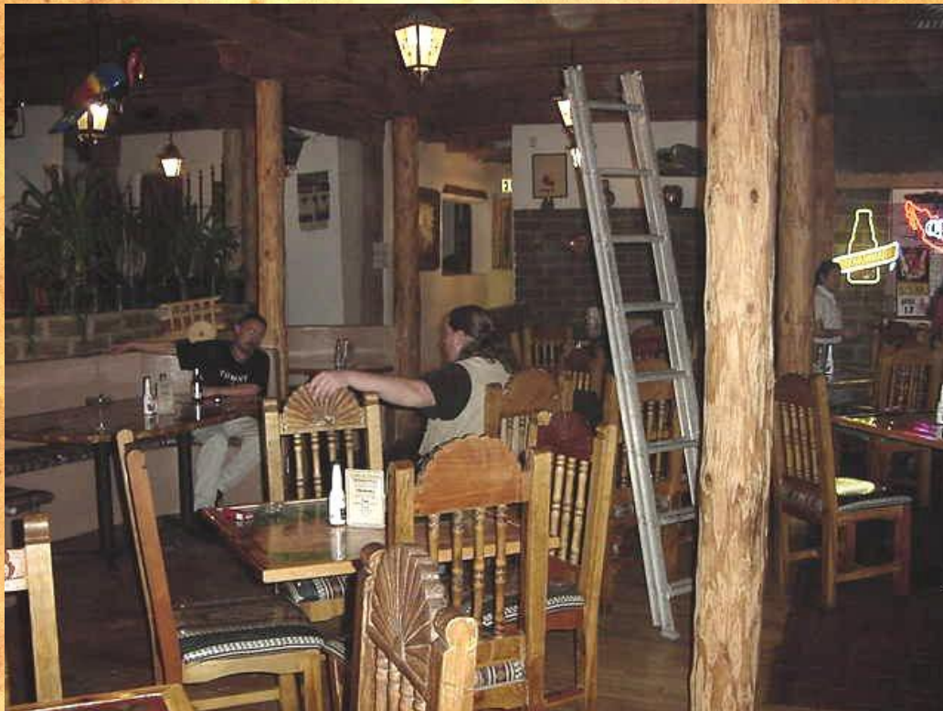
Conducting interviews with the employees