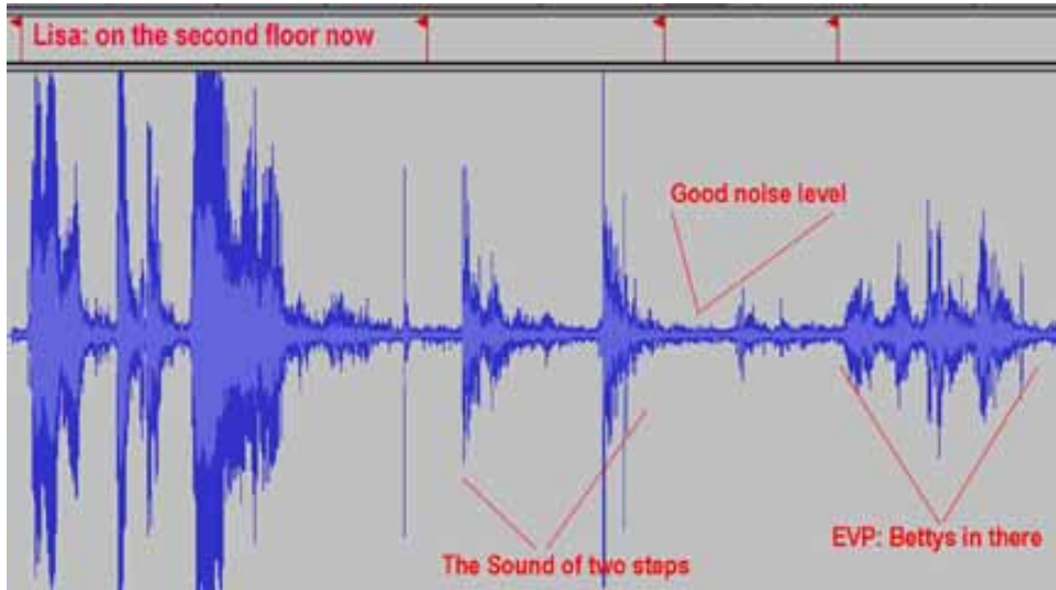
Figure illustrating a sound track with the utterance, “Betty’s in there.” A workable level for background sound used in voice formation is shown. The increase in amplitude of the voice is believed to be due to the accumulation of energy prior to formation of the utterance. This is transform EVP.

Since research shows that the voices are formed from available audio frequency energy, 7 some noise will be required for this experiment. Inexpensive digital voice recorders usually produce sufficient internal voice frequency noise for EVP formation, but if EVP are not collected in the above enclosure when the recorder is known to produce EVP in the open, it may be necessary to include a sound source, such as a turned-on am radio with the volume set so that the resulting static would not obscure the voice of a person speaking into the microphone.